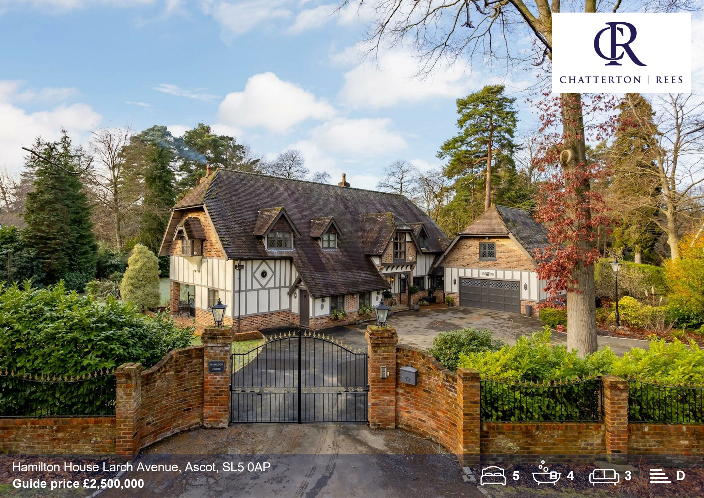
Hamilton House Larch Avenue, Ascot, SL5 0AP Guide price £2,500,000